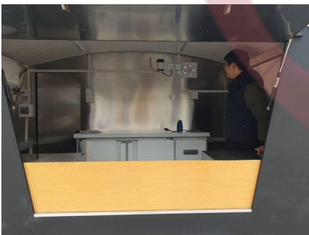
- Window -