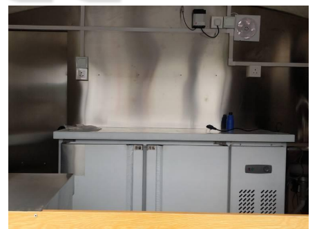
- Fridge -