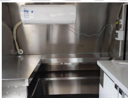
- Workbench -