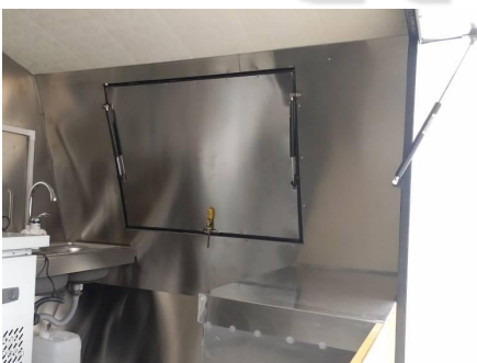
- Interior -