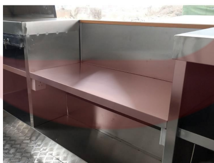
- Workbench -