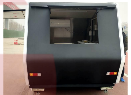
- Side Window -